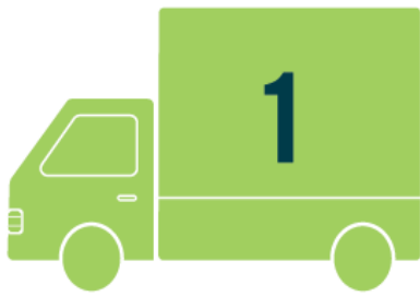
Unfilled Flat Flexible Pouches

Transportation of 1 truckload of unfilled flexible pouches is equivalent to 26 truckloads of unfilled glass jars. 2